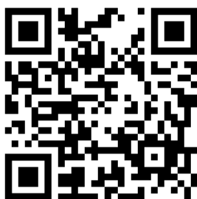
Enrollment inquiry form

Questions? Contact Central Office enrollment@ledyard.net